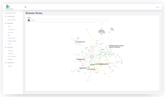
The term browser is a visual representation of the thesaurus of words that is used to answer questions about policies in the Atlas.